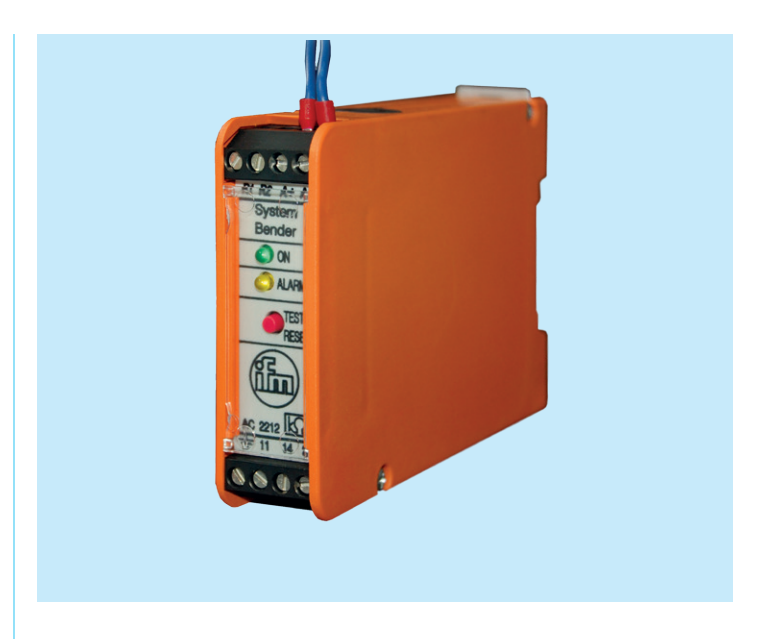
ASi line insulation monitor

Contact 11/14 is triggered additionally by asymmetrical faults. The contacts are closed when the ASi voltage is applied and there is no fault.