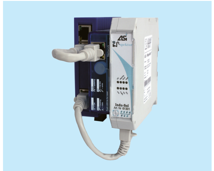
ASi-INSpektor® with Webinterface (StarterKIT)