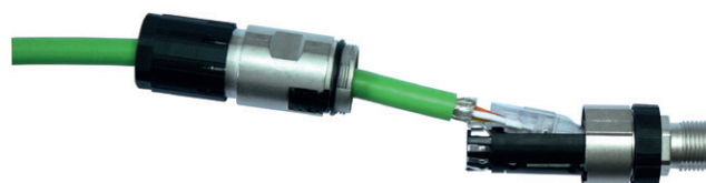
Sample application (side view)