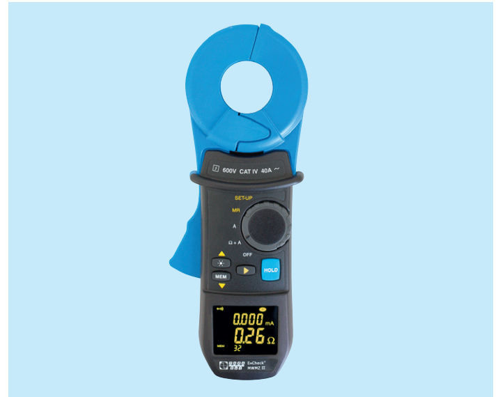
EmCheck® MWMZ II