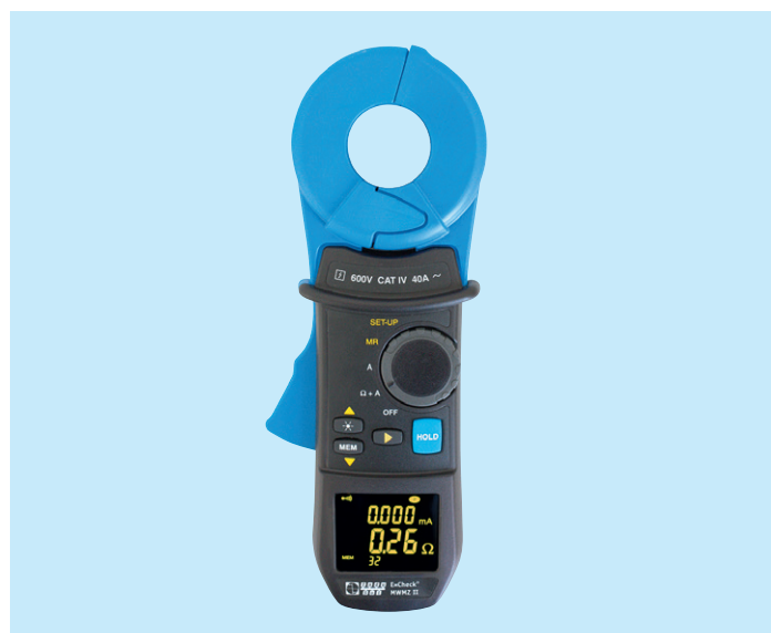
EmCheck® MWMZ II