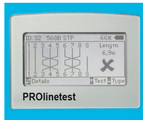
Example of error diagnosis