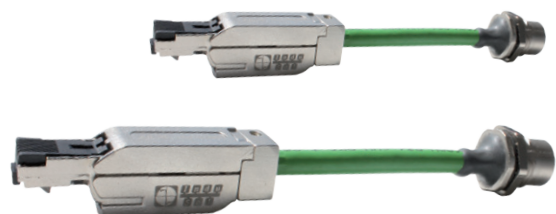
Adapter set with RJ45 plug on M12 socket for PROFINET