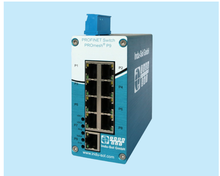
PROFINET Switch PROmesh P9