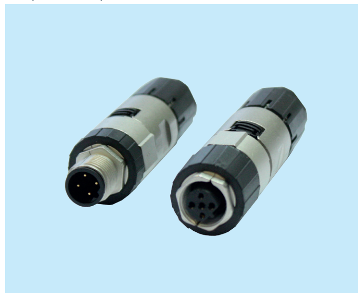
M12 round plug connector FC Plug PRO (B-coded)

The M12 round plug connector FC Plug PRO (B-coded) is a coordinated system of PROFIBUS Fast Connect plug connectors and an extensive range of Fast Connect cables with the appropriate UL approvals.