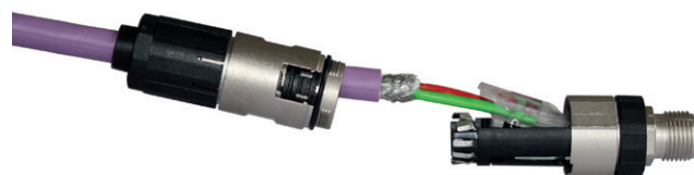
Sample application (side view)