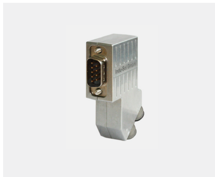
Connector M12 with PG 35° spezial

Plugs are passive components and are not subject to the CE mark system pursuant to EU Directives.