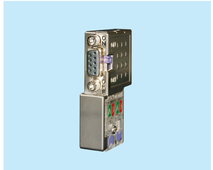
Connector PG/90° Fast Connect

Plugs are passive components and are subject to the CE mark system pursuant to EU Directives.