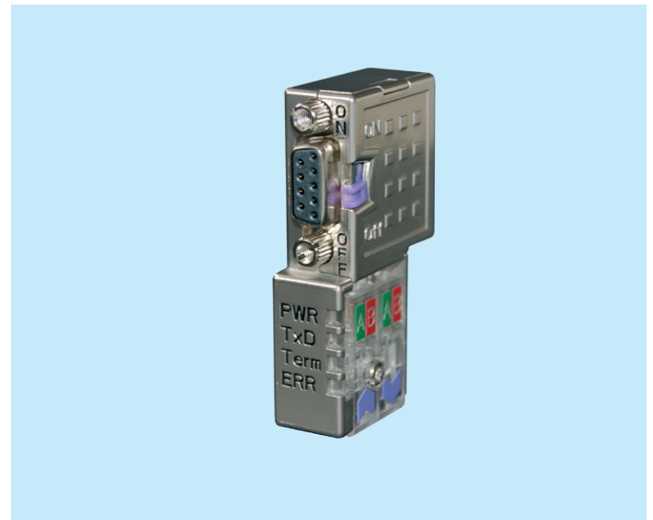
Diagnostic connector PG/90° Fast Connect

Plugs are passive components and are subject to the CE mark system pursuant to EU Directives.