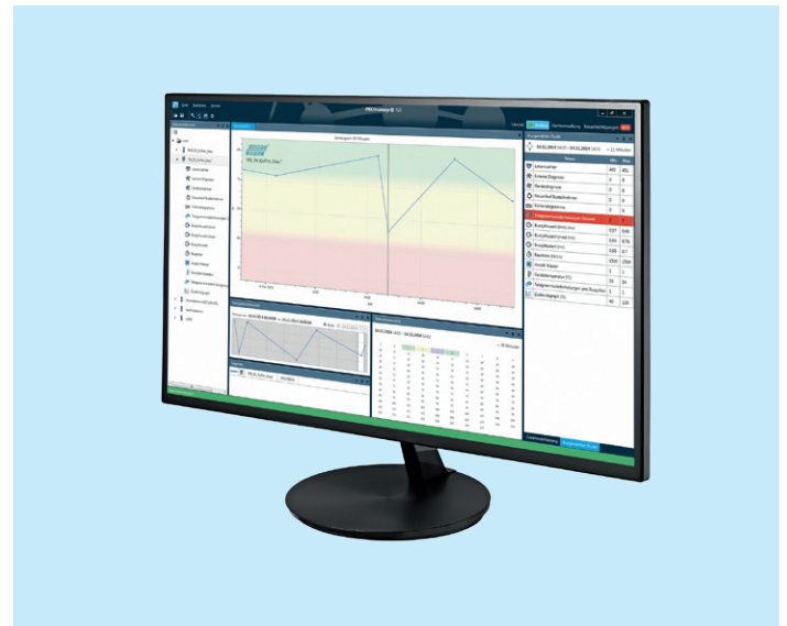
Network management software PROmanage® NT