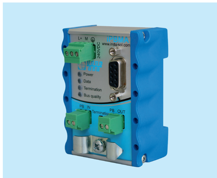
Intelligent measuring point iPBMA IP20