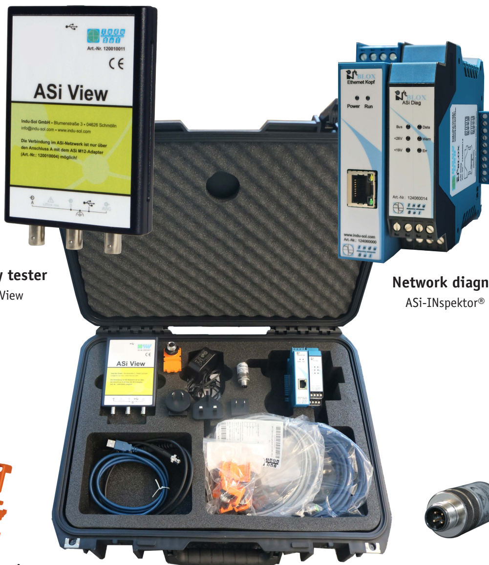
Quality tester ASi View