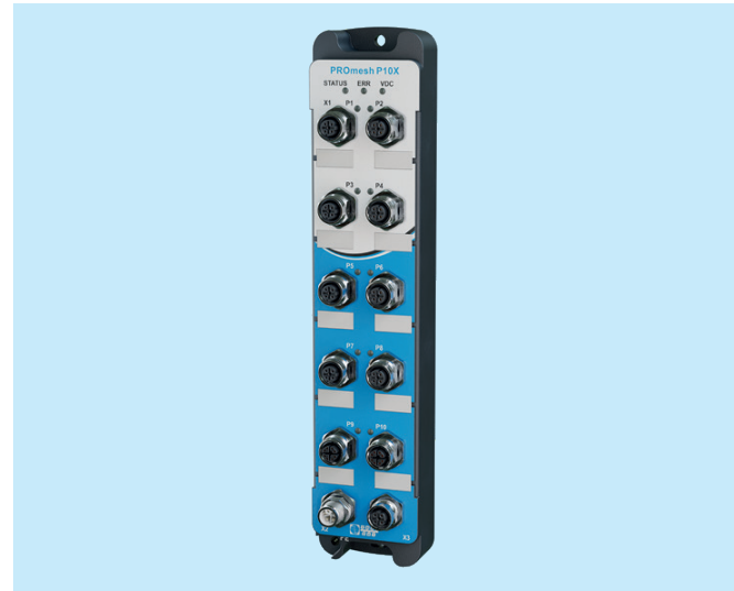
PROFINET Switch PROmesh P10X