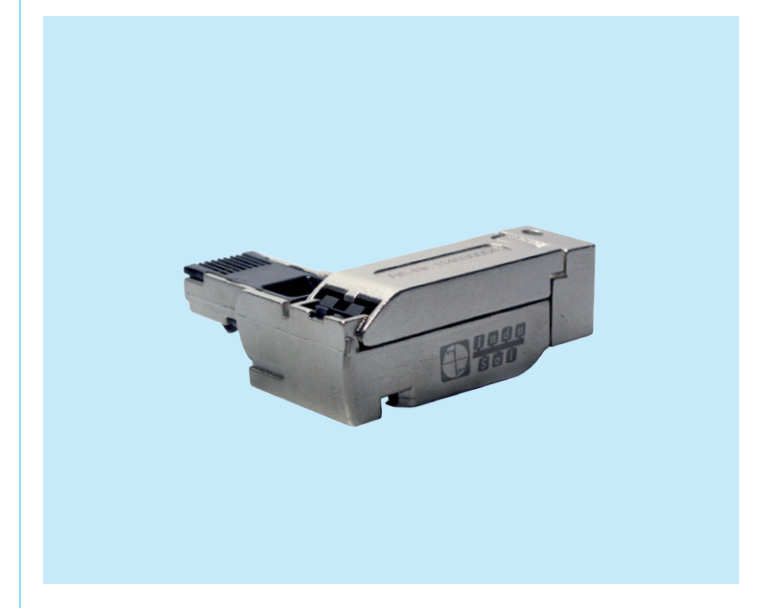
Connector RJ45 Fast Connect Plug 90°