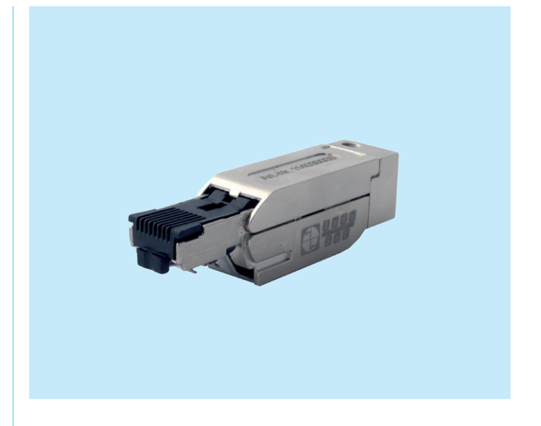
Connector RJ45 Fast Connect Plug 180°